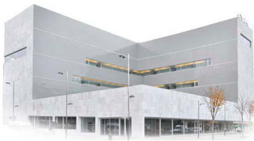
Bizkaia Aretoa building

The Bizkaia Aretoa hosts all kind of social, cultural, academic and scientific events, either organized by the University of the Basque Country (UPV/EHU) or external institutions. As a result, the Bizkaia Aretoa has become a reference place for hosting events in Bilbao.